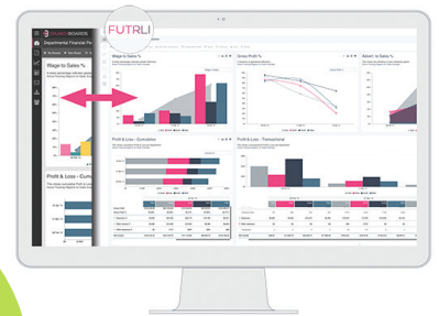
A reporting dashboard